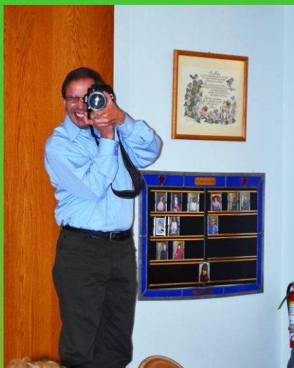
The Prez was taking pictures!

ST. John's had it's Time and talent auction on October 28th. It was a terrific success with donations exceeding $2,000. AND, lots of fun and laughter was had by all! Here are just some pictures from the even. If you missed it....make sure you are there for the next one!