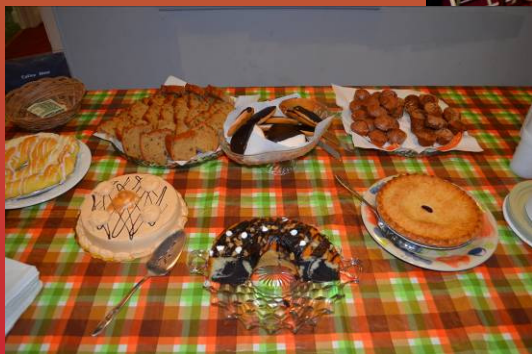
There were some delicious goodies served in addition to the goods offered for bidding.