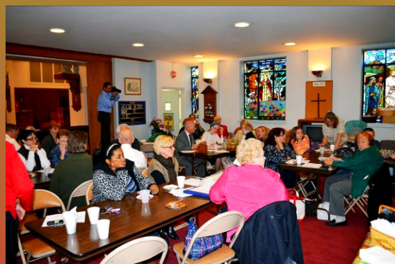
The loud crowd