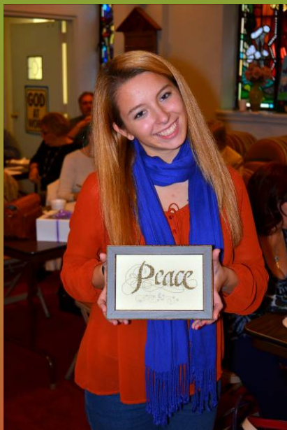
Perfect sign for the season